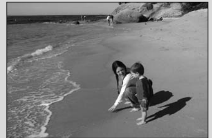
Aliso Beach, Near the Aliso Creek Inn in South Laguna

The Brain-Wise Therapy Conference with Bonnie Badenoch, Ph.D. and Theresa Kestly, Ph.D. will take place at the Daytona Beach Resort and Conference Center on May 6-7, 2010 and then again at the Aliso Creek Inn in Laguna Beach on November 18-19, 2010. At both hotels, we have reserved a block of rooms with special conference rates if reserved 30 days in advance. Call 505-898-1177, or log on to our website, www.sandtraytraining.com , and then click on either the Daytona Beach page or the Laguna Beach page for details, including conference location, fee, and room rates. The conference begins at 9:00 a.m. each day and finishes at 5:00 p.m. allowing plenty of time for walking on the beach and playing in the sand.