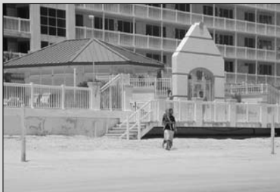
Daytona Beach Resort and Conference Center