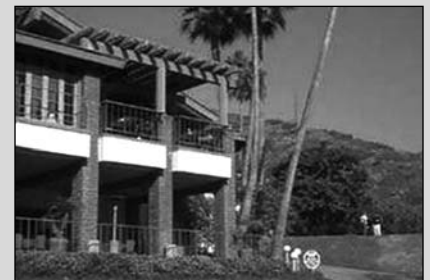
Aliso Creek Inn Conference Center